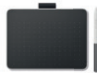
Wacom One S Pen tablet