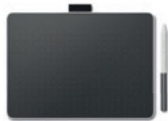
Wacom One M Pen tablet